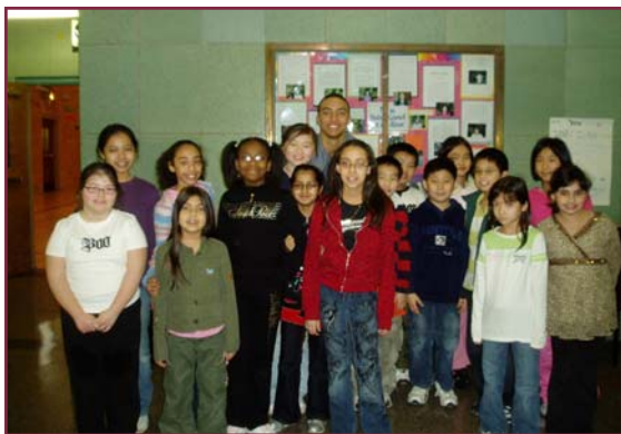
PS 46 Bayside Alley Pond School Student Council's Penny Harvest Team

Common Cents' Penny Harvest is an innovative program designed to introduce young people to philanthropy.